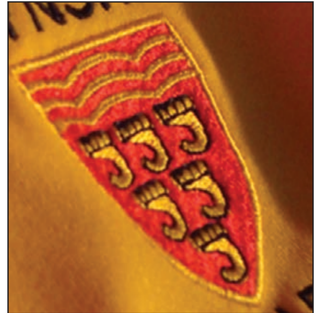
The old crest (left) with the new interpretation (above)